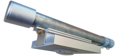
Mounting on streetlight arm